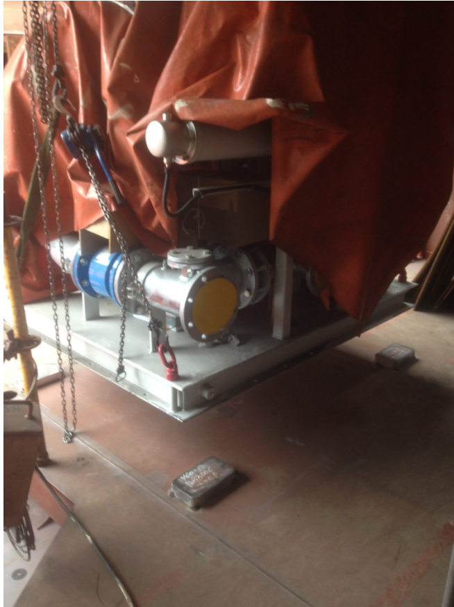
BL 08 - stern tube on slipway